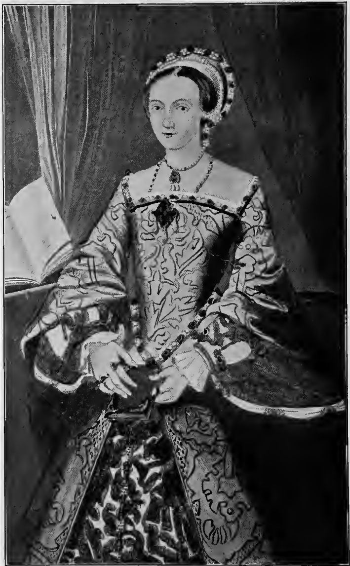
QUEEN ELIZABETH AS A YOUNG WOMAN